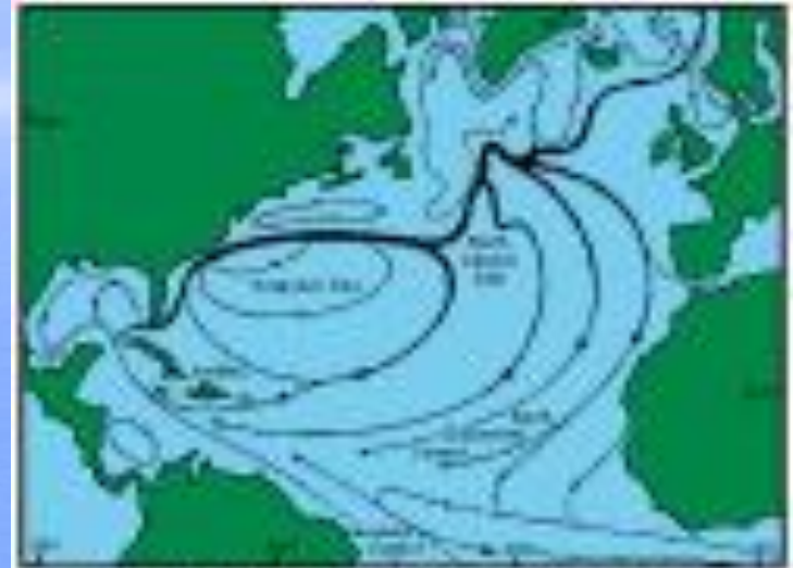
The Gulf Stream and the North Atlantic Drift are the surface circulation of the Atlantic Ocean. The system originates north from the equatorial current system, flowing from the Caribbean Sea, at the mouth of the Gulf of Mexico, to the North Atlantic, where it splits into the Gulf Stream and the North Atlantic Drift.